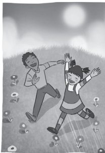
1. It's sunny .

2. Look at the pictures. Write the correct weather words from Exercise 1.