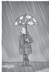
2. It's _____.